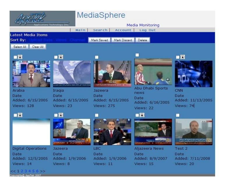
Figure 2: MediaSphere Screenshot of a Media Content Repository

ing (GIS) algorithm to change the weighting of these features during the training process.