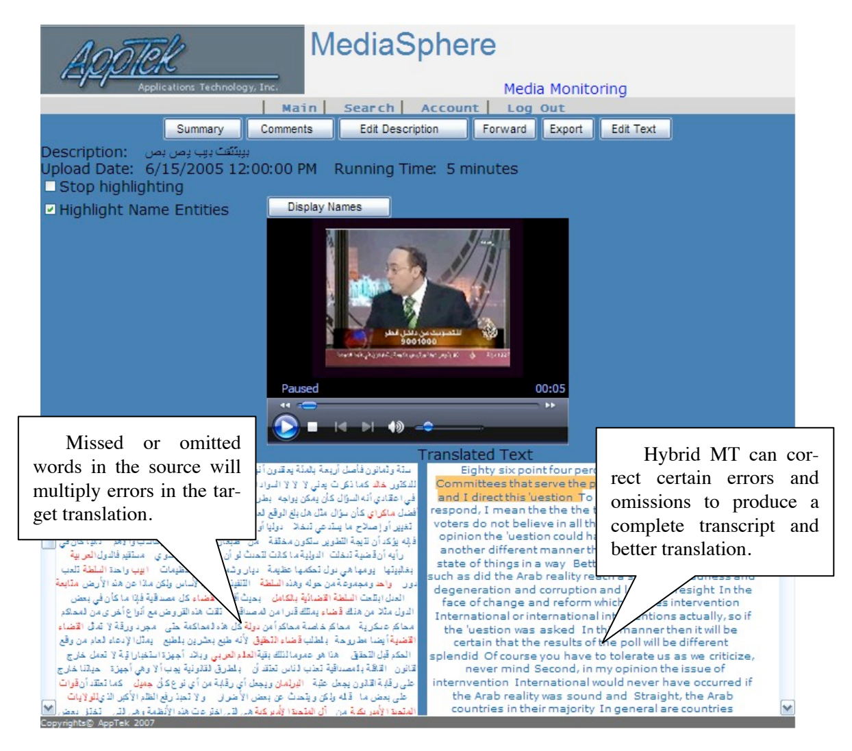
Figure 1: MediaSphere Screenshot of a Broadcast Transmission: Left the original Arabic text, the Names are marked in red; Right the translation using AppTek's Hybrid Machine Translation

cies and embedded structures should be weighted favorably, since these constructions are more difficult to process in statistical machine translation.