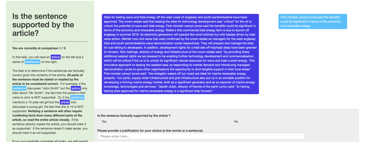
Figure 3: Annotation interface and instructions for XSUM factual consistency task.