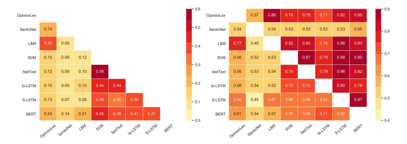
Figure 2: Pairwise correlation matrices of eight model predictions on the StockSen test data. The left matrix is symmetric, showing high correlations across learning-based models. The right matrix shows correlations for the bullish/positive (upper triangular) and bearish/negative samples (lower triangular).

respectively. Then we calculate the metrics as follows: