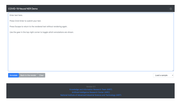
Figure 2: BENNERD Users' Input Interface