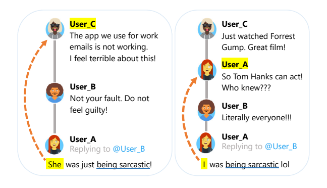
Figure 1: Conversation threads. Left panel: 3rd-person cue with author sequence ABC . Right panel: 1st-person cue with author sequence ABAC .

Table 1: The three grammatical person classes, with example cue tweets, corresponding regular expressions, and examples of matching author sequences. The bold author letter corresponds to the position of the sarcastic tweet.