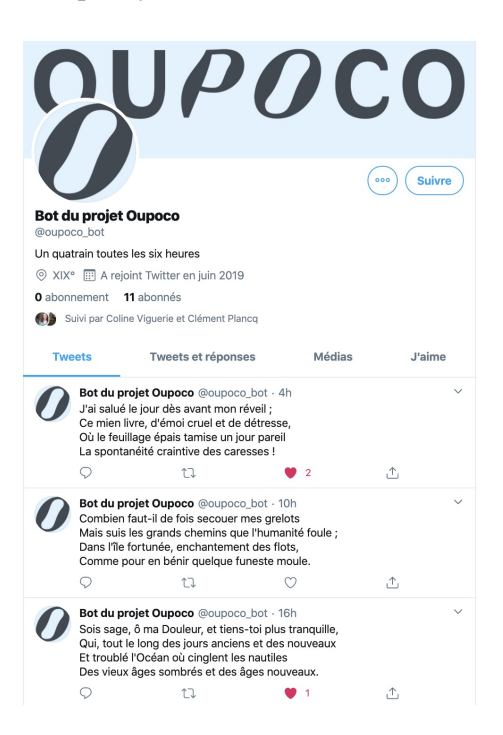
Figure 2: The Oupoco bot on Twitter

events (based on Raspberry Pi components). Through these devices our goal is to reach a wider audience and engage people to reconnect with poetry.