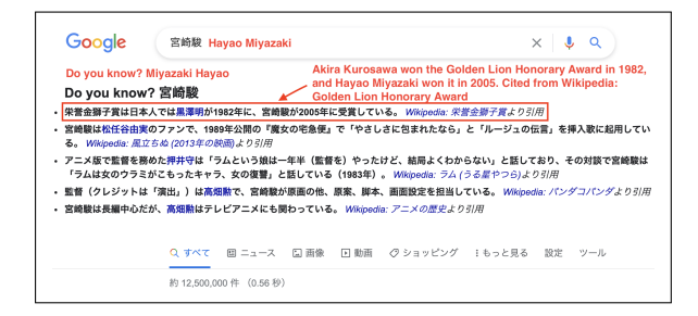
Figure 2: A screenshot of our chrome plugin. For the Japanese search query Hayao Miyazaki, top five interesting relationships are presented at the top of the search results. The red texts are translations of them.

are considered limited. In particular, although relationships between persons are important as a target for text mining, there are few effective approaches for extracting interesting relationships between persons.