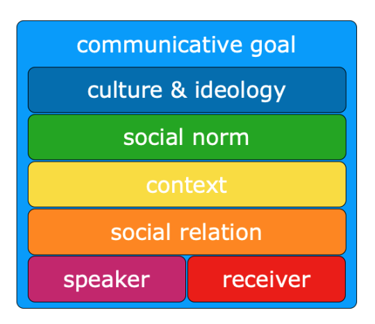
Figure 2: Taxonomy of social factors

Building upon these two frameworks, we lay out a set of seven social factors that NLP systems need to be aware of to overcome current limitations (see Figure 2). We cover SPEAKER characteristics (Section 2.1), RECEIVER characteristics (Section 2.2), SOCIAL RELATIONS (Section 2.3), CONTEXT (Section 2.4), SOCIAL NORMS (Section 2.5), CULTURE AND IDEOLOGY