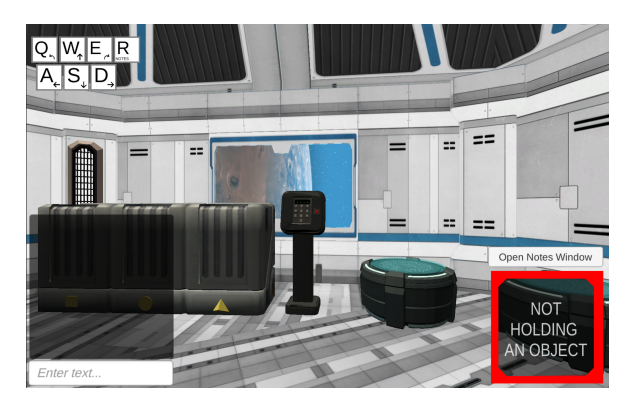
Figure 1: First-person graphical user interface (GUI) used by participants to tele-operate the robot in the study. A message box for communicating with the Commander is in the bottom left, and an "inventory" showing the currently-held object is in the bottom right.

formation reflects the particular type of uncertainty that the agent experienced, and tracking that uncertainty helps to inform how agents can use questions (and answers) to manage that uncertainty.