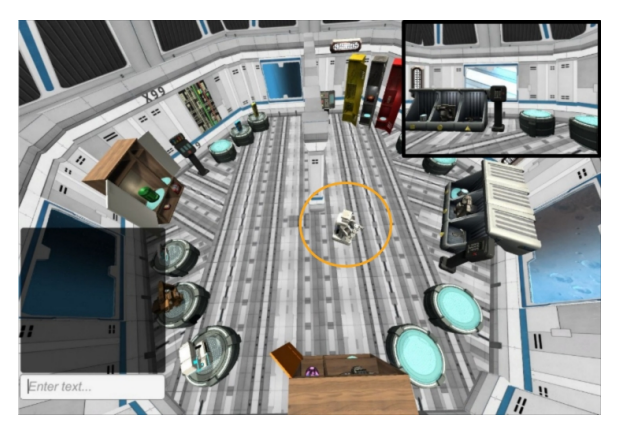
Figure 2: Interface used by the human confederate playing the Commander. The main view shows the robot (circled in orange) in the environment. The top right corner shows the first-person view seen by the human participant playing the robot. The bottom left corner shows a message box for text dialogues with the participant.

In the task, the human-controlled robot was placed in a virtual spacecraft (see Figure 1). The task was to organize six tools (among 12 distractors) scattered around the spacecraft – an activity that is