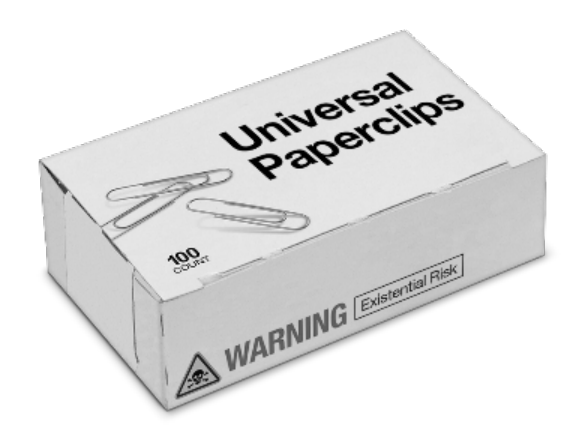
Figure 3: Downplaying the capabilities of current ML systems makes it less likely that we'll be well prepared for the impacts that come from developing highly-capable future systems. That can be bad. Image from Lantz (2017).

Instrumentally-Convergent Subgoals The instrumental convergence hypothesis holds that systems that are optimizing for benign objectives, once they become sufficiently capable, have a predictable reason to take on dangerous subgoals —like accumulating large amounts of computational, economic, or political power—to maximize the odds that their primary objectives are achieved (Bostrom, 2003; Omohundro, 2008; Bostrom, 2012).<sup>10</sup> Even with merely near-human-like lev-