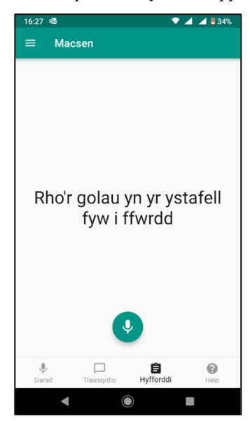
Figure 2 - the Macsen Voice Assistant with the Hyfforddi (Training) bottom navigation bar tab selected and a sentence provided for recording: "Switch off the lights in the living room"

Previous work on speech recognition for Welsh had been motivated solely by the development of Macsen, a voice assistant for Welsh speakers that can run on Android or iOS devices (Jones, 2020). Despite a lack of speech data, a functioning and everyday useful Welsh voice assistant was achieved, provided the assistant's speech recognition capability was constrained to recognizing only a closed set of commands and questions that trigger a small collection of the most practical and effective skills, such as for retrieving news, providing weather forecasts and playing music. This work was able to update Macsen's speech recognition model with a larger training dataset and expand its ability to support more new skills while not degrading the performance or the practicality of the app.