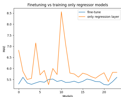
Figure 3: Fine-tuning vs training only regression layer in the models. The x-axis represents the 24 different models of each category. The y-axis shows the MAE corresponding to each model.