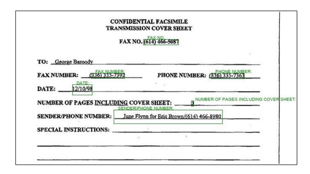
Figure 4: Document specific annotations by labeling regions/texts identified as 'Value' with respective 'Key' in intermediate annotations as shown in figure 3.