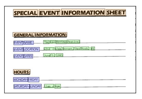
Figure 1: Form Example from FUNSD: Keys are represented in blue, headers in orange, and Values in green.

With the recent advancements in technology and increased adoption of digitization, almost all organizations maintain and exchange business documents in digitized formats like PDFs, scans, faxes, images etc. These documents come in all shape, sizes and format like invoices, emails, medical reports, contracts, scientific papers and many more. The majority of the research has concentrated on documents present on the web that do not adequately capture the complexity of analysis or comprehension required for business documents. These documents