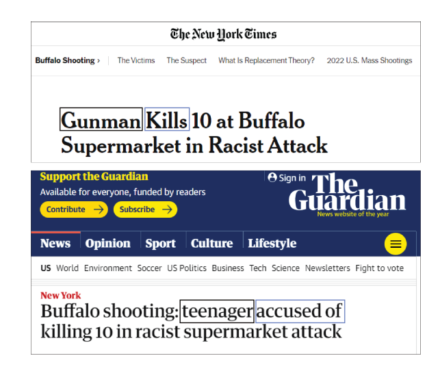
Figure 1: Framing devices deployed in the headlines of two news reports published by The New York Times and The Guardian on the 2022 Buffalo mass shooting.

rally compared to those who read the public order news story (Nelson et al., 1997, p. 581). Figure 1 shows similar frames deployed in two news headlines on the 2022 Buffalo mass shooting.