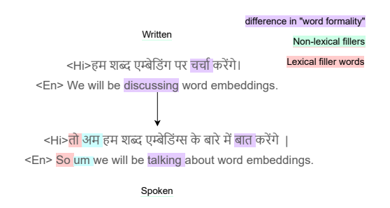
Figure 1: Text style transfer from written to spoken parallel sentences.

Style transfer has been one of the well-studied tasks in the field of Artificial Intelligence (AI). Most of the earlier works using deep learning were in the domain of Computer Vision (CV; Gatys et al., 2016; Zhu et al., 2017). The task of text style transfer (TST) saw a surge in research interests