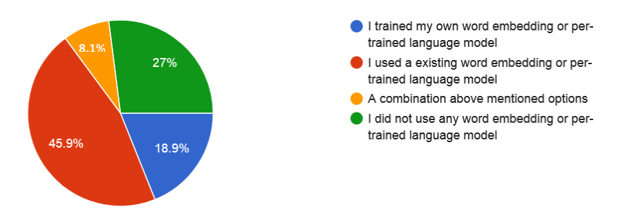
Figure 2: Pretrained models used by participants

model using BERT scored an averaged-macro F1 score of 0.57 and ranked fourth in the shared task.