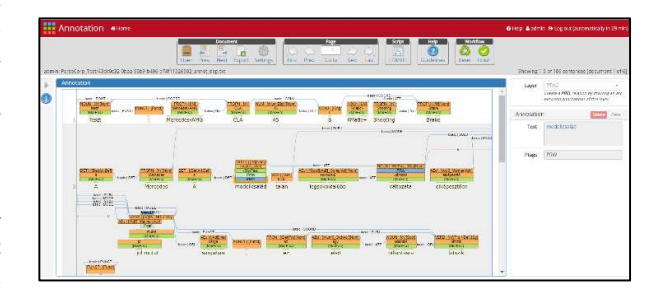
Figure 1: Annotation in preprocessed text with Webanno.

For manual annotation, I used the Webanno web-based annotation tool (Eckart de Castillho et al., 2016).<sup>4</sup>