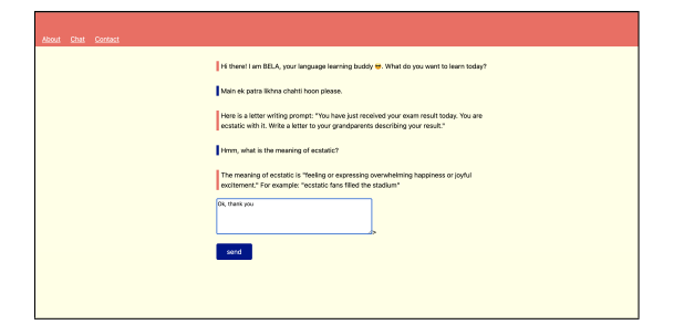
Figure 1: An interaction between the user and the Tutor Bot. Here, the user makes a query in the Hinglish language which translates to "I want to write a letter today."