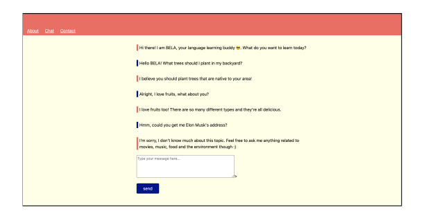
Figure 2: An interaction between the user and the Buddy Bot. Here, the agent politely nudges the user to a relevant topic if they discuss anything beyond movies, music, food and environment.

This function identifies the word/phrase whose translation is to be found from the user utterances using regex extraction techniques; identifies the language of the phrase; and returns a translation. The function uses the XLM-RoBERTa<sup>14</sup> transformer model from HuggingFace for language detection and a Transformer-based Machine Translator from Salesken.ai<sup>15</sup> for Hindi-English translation.