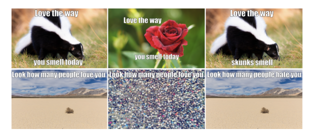
Figure 1: Illustrative (not real) examples of multimodal hateful memes from Kiela et al. (2020). While the memes on the left column are hateful, the ones in the middle are non-hateful image confounders, and those on the right are non-hateful text confounders.

Multimodal memes, which can be narrowly defined as images overlaid with text that spread from person to person, are a popular form of communication on social media (Kiela et al., 2020). While most Internet memes are harmless (and often humorous), some of them can represent hate speech.