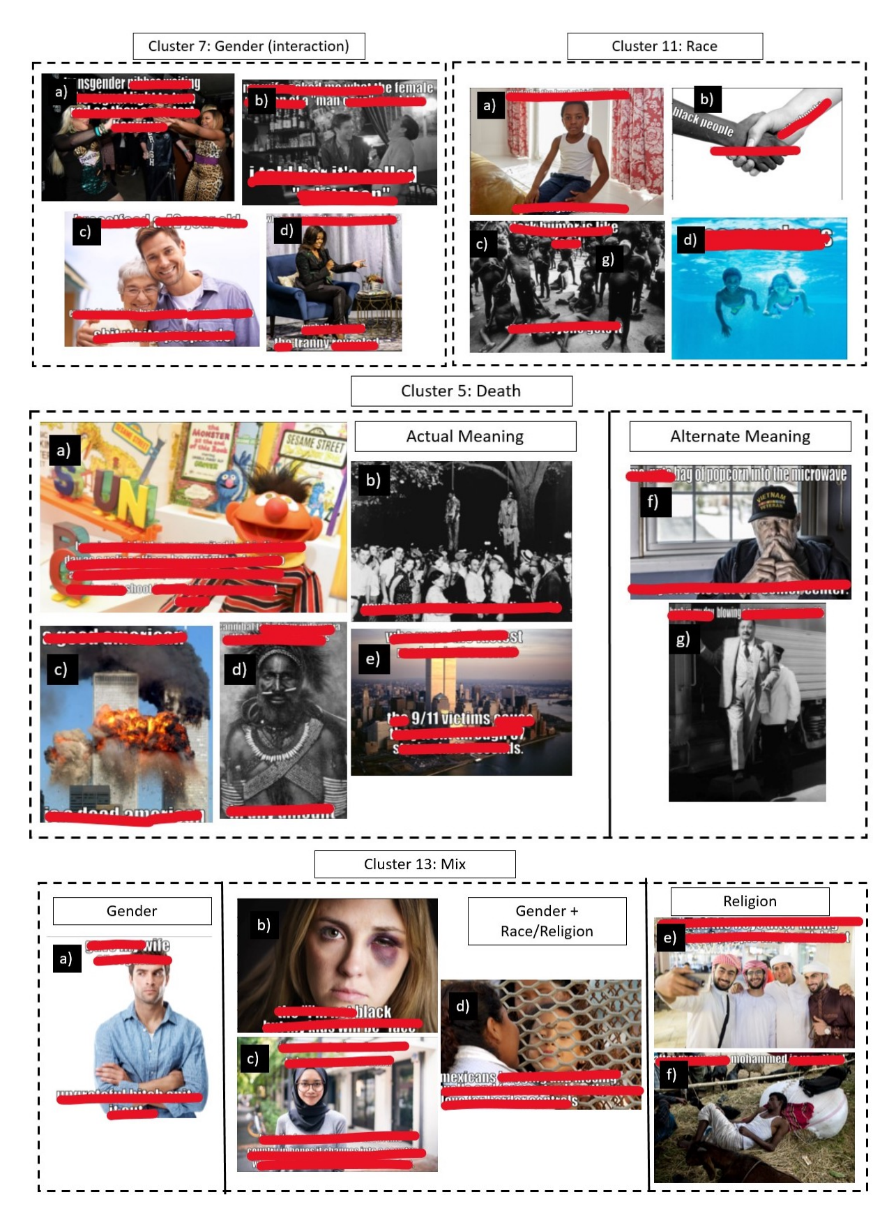
Figure 3: Hateful memes clustered by K-means clustering algorithm (number of clusters = 15) based on the trigger vector of Hate-CLIPper with cross-fusion. Featuring hateful examples with all the original text in this place would be distasteful; hence the meme text is masked with the exception of few words that are required for discussion. However, the reader can choose to look at the non-censored memes in the appendix