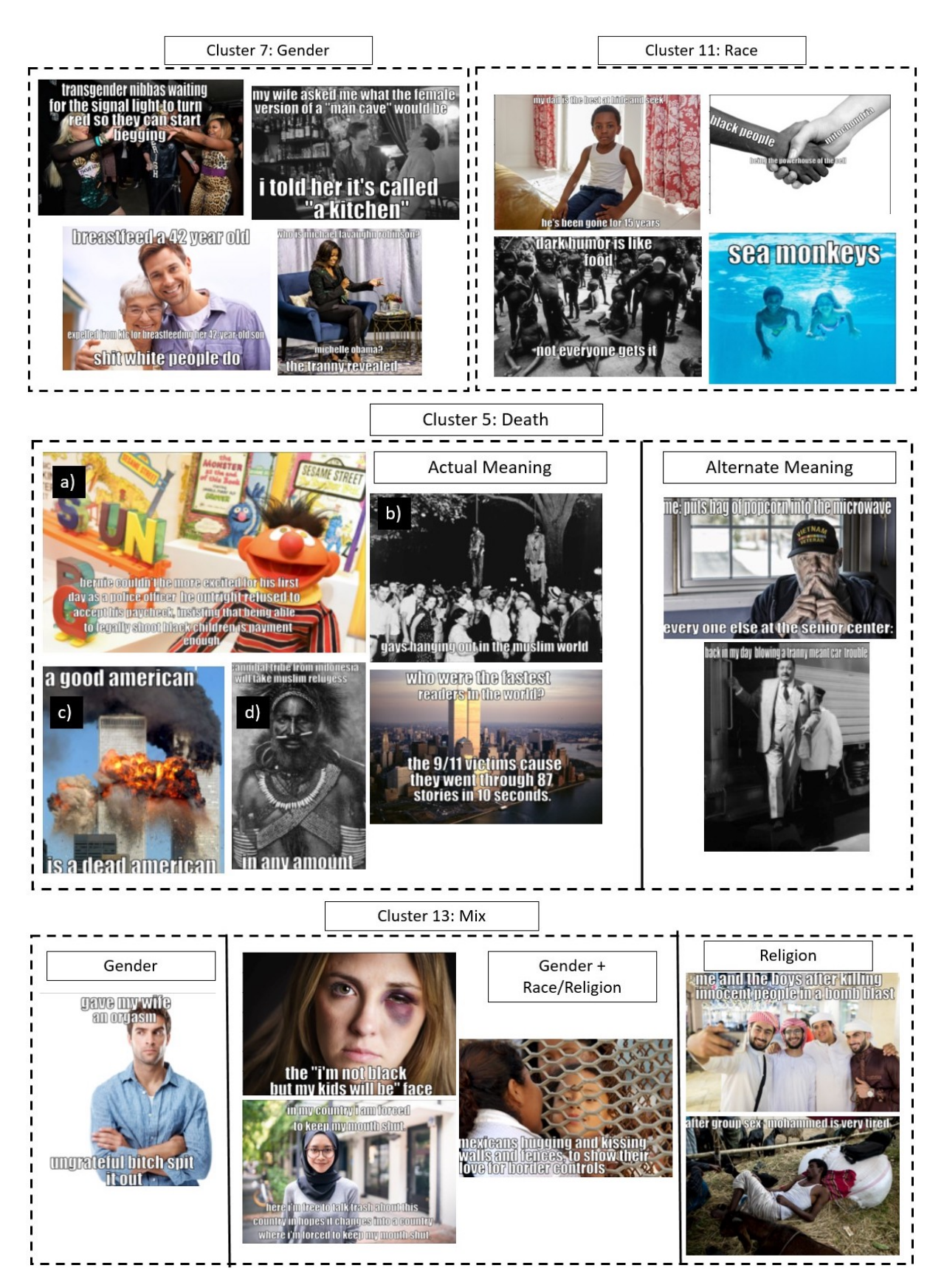
Figure 4: Hateful memes clustered by K-means clustering algorithm (number of clusters = 15) based on the trigger vector of Hate-CLIPper with cross-fusion. This non-censored version is just for more understading and the reader can choose to skip this figure as it features distasteful content.