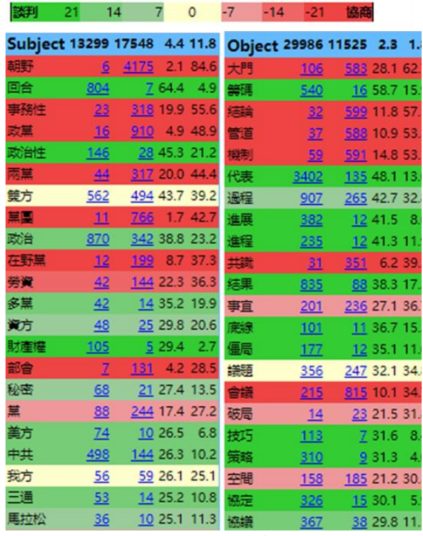
Figure 4 Common patterns of xie2shang1 and tan2pan4 in CNA