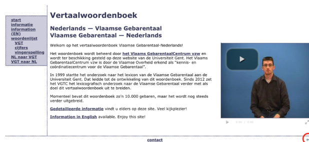
Figure 1: A screenshot of the home page of gebaren.ugent.be

to project a report of lexicographic research on a website, the goal was to make the new dictionary a practical, user-friendly reference tool that meets the needs, expectations and skills of the dictionary users. To gain a better understanding of who the users were, several sources were consulted: the user research by Oyserman (2013), the quantitative data from Google Analytics and VGTC's own user profiles.