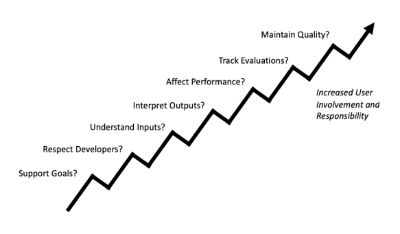
Figure 1 Trust Growth in the AI Adoption Journey

Our business unit specializes in providing AI/ML solutions to customers seeking to use NLP and other AI capabilities to augment human analysts. Our typical use case involves customers with a small number of highly specialized subject matter experts (SMEs) who need to assess a large number of documents in a short amount of time, often in the context of high-stakes missions. Our third-party NLP solution space is comprised of secure, cloud-deployed processing pipelines that transform unstructured text collections into actionable insights using combinations of customized entity extraction and text classification. The pipelines produce a sortable and filterable data stream