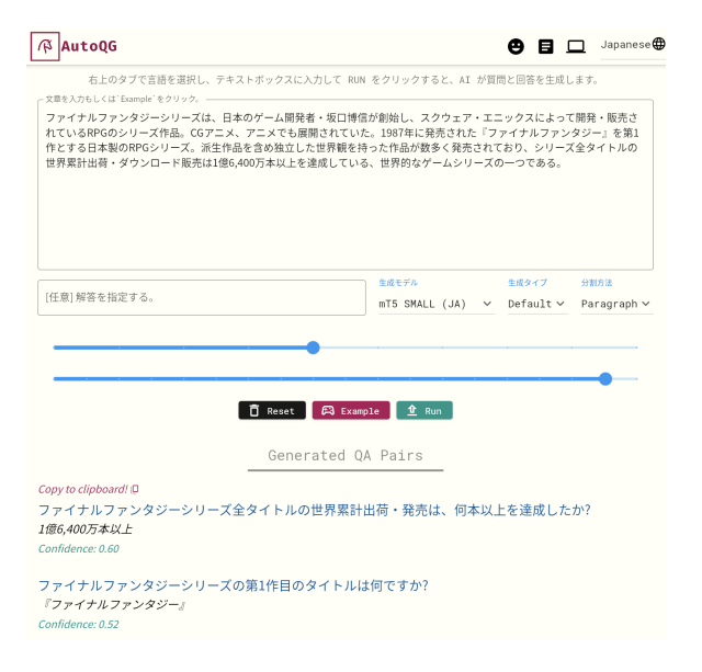
Figure 3: A screenshot of AutoQG with an example of question and answer generation over a paragraph in Japanese.