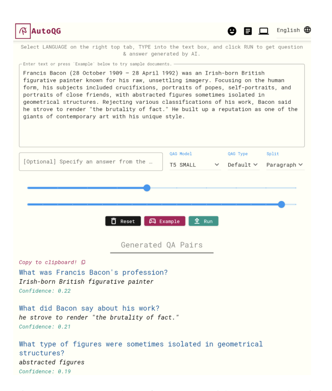
Figure 2: A screenshot of AutoQG with an example of question and answer generation over a paragraph.

generations based on the QAG models in each language, it entails large memory requirements on the the hosting server. As such, we compute a lexical overlap between the question and the document as a computationally-light alternative to the perplexity, which is defined as: