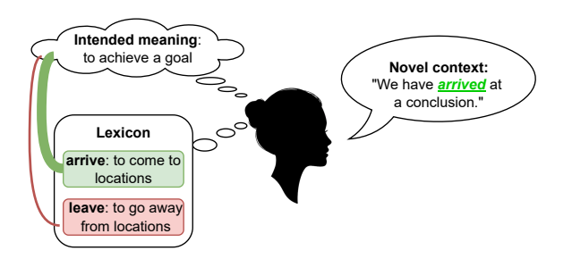
Figure 1: Illustration of the problem of word sense extension. Given a novel context, a speaker chooses an existing word in the lexicon to convey a novel intended meaning that has not appeared in the semantics of that word. The speaker determines the appropriateness of a chosen word (indicated by line width of the colored curves) based on semantic relatedness between the novel intended meaning and existing word meanings.

Humans make creative reuse of words to express novel senses. For example, the English verb arrive extended from its original sense "to come to locations (e.g., to arrive at the gate)" toward new senses such as "to come to an event (e.g., to arrive at a concert)" and "to achieve a goal or cognitive state (e.g., to arrive at a conclusion)" (see Figure 1). The extension of word meaning toward new context may draw on different cognitive processes such as metonymy and metaphor, and here we develop a general framework that infers how words extend to plausible new senses.