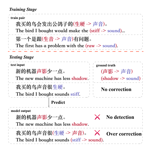
Figure 1: Mistakes made by regularly fine-tuned BERT.

From a high-level perspective, CSC requires a language model and an error model working