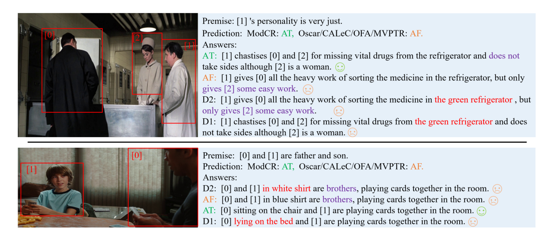
Figure 3: Two cases from the test set of PMR. Different persons are represented by red squares and numbers in the left images. For answer candidates, the red words indicate the content that does not meet the image; the purple indicates the content that is conflict with the premise text clues; and the green and orange indicate the correct option and the wrong answer respectively.

Is Alignment Mapping Network Effective? From Table 4, comparing ModCR performances with LA=0 and LA >= 1, we observe that the performance of ModCR drops markedly when it abandons vision-language semantic alignment information. Compared to PromptFuse that randomly initializes two learnable alignment prefix vectors, the proposed alignment mapping network equipped with the multi-grained cross-modal alignmenter is more effective, e.g., PromptFuse vs. RoBERTa-L: 76.5 vs. 75.0, and performance comparisons of ModCR vs. RoBERTa-L.