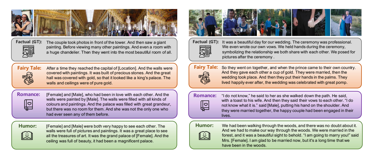
Figure 4: Examples of stylized stories generated by our proposed StyleVSG. Note that the goal of Stylized Visual Storytelling is to describe a photo stream with an abstract story, which reflects a specific linguistic style and contains imaginary concepts.

3. StyleVSG-Multi can achieve almost the same performance as StyleVSG (three models for three styles), but with far fewer parameters.