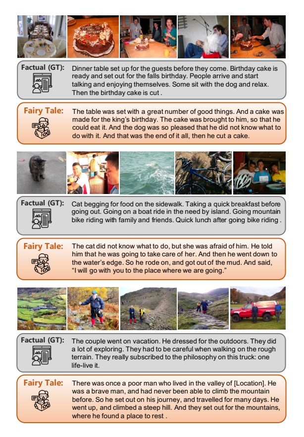
Figure 6: More examples of fairy tale stories generated by StyleVSG.

In Figure 5 and 6, we represent more examples of stylized stories generated by StyleVSG.