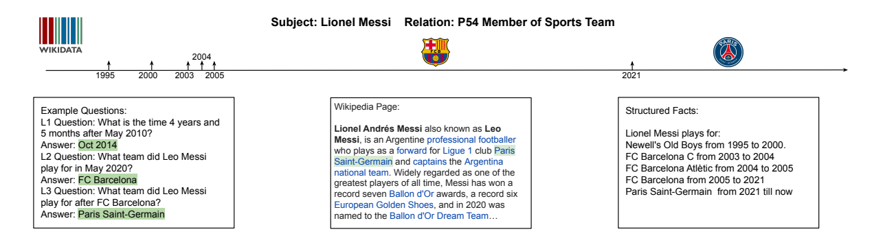
Figure 2: Sample TEMPREASON questions and contexts. For humans, the L1 question can be answered without any context provided, whereas for L2 and L3 questions, humans will need to ground the events to timestamps and then perform temporal reasoning.

ble 3). (2) Time Grounding . The second challenge of TSQA is temporal grounding. That is, this subtask is to find the start time and end time of each possible answer. (3) Temporal Reasoning . The last challenge is finding the correct answer among the possible candidates based on the specified time constraints.