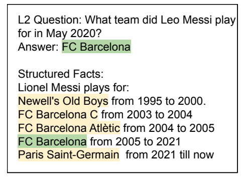
Figure 3: An example of time-sensitive reinforcement learning (TSRL). The ground truth is highlighted in green color and the negative answers are highlighted in yellow color.

Supervised Fine-Tuning (SFT) The TSE pretrained language model with parameters \theta will then be fine-tuned on the task data in each setting. The input prompt to the LM is the concatenation of question q and context c, and the objective of SFT is to maximize the probability of P(a|q, c), where a is the correct answer.