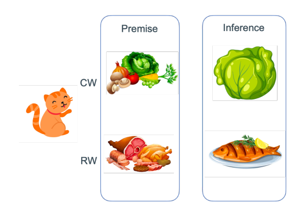
Figure 1: Illustration of Exp1 set-up

Table 1: Exp1 items (logical completion underlined).