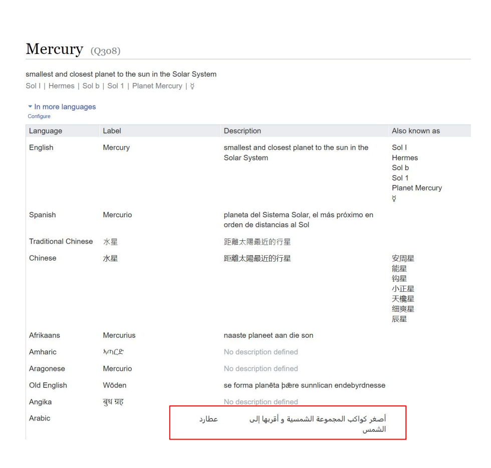
Figure 6: The entity (Article Title ) description in Wikipedia. This entity description can be accessed manually for any page in Arabic Wikipedia by clicking on tools ( أدوات ), then page information (معلومات الصفحة).