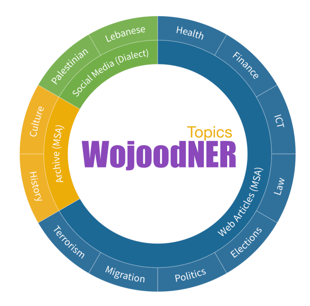
Figure 1: Topics in the Wojood NER corpus.

NER is a fundamental task in Natural Language Processing (NLP), especially in information extraction and language understanding (Jarrar et al., 2023a). The objective of NER is to identify and classify named entities in a given text into predefined categories, such as "person", "location", "organization", "event", and "occupation". NER is also a critical task for many NLP applications, such as question-answering systems (Shaheen and Ezzeldin, 2014), knowledge graphs (James, 1991), and semantic search (Guha et al., 2003), interoperability (Jarrar et al., 2011) among others. Named entities can either be flat or nested. For instance, in the sentence "Cairo Bank announces its profit in 2023", there are two flat entities: "Cairo Bank" is tagged as ORG (i.e., organization) and "2023" as DATE. In nested NER, entity mentions contained inside other entity mentions are also considered named entities. In this case, "Cairo", is tagged as GPE (i.e., geopolitical entity). Section 3 illustrates more examples. As will be discussed in Section 2, research in Arabic NER is currently limited, particularly in the context of nested entities. This limitation is not exclusive to Modern Standard Arabic (MSA) but extends to various Arabic