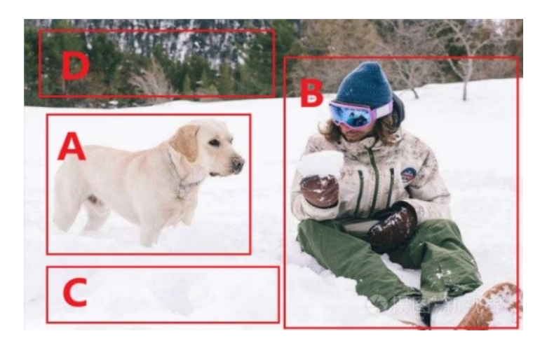
Figure 1: An example for MNER with (A and B) the useful visual clues and the (C and D) useless visual clues.

in the pre-training language model itself. To overcome this limitation, we propose the use of prompt learning(Liu et al., 2023) to process the fused features, followed by final training.