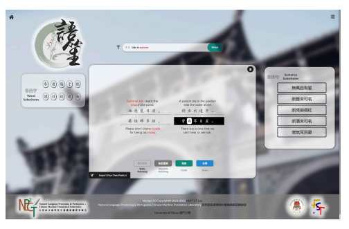
(a) Static Polishing: Substitutes Recommendation