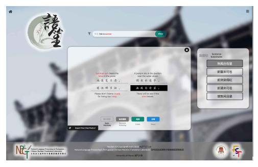
(b) Static Polishing: Result