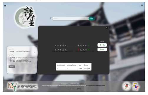
(d) Poem Analysis