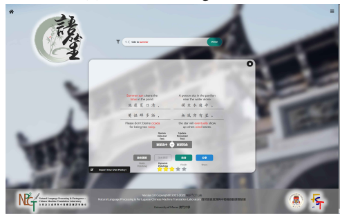
(d) Dynamic Polishing: Result