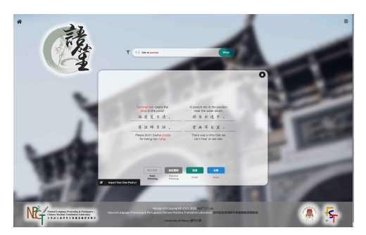
(b) Poem Generation Result