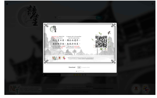
(e) Share Page