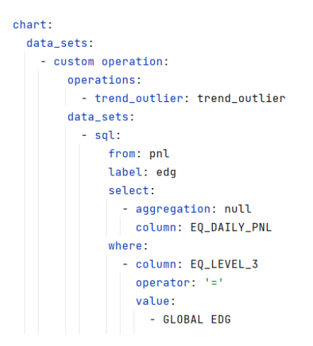
Figure 1: Example AST serialized into YAML format.