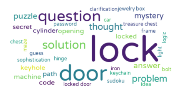
Figure 5: Word cloud of human completions for B 1 (Table A.6). While most responses were from the same semantic domain, some were creative and appropriate (e.g., treasure chest, jewelry box, car).

Symbolic approaches usually represent input as structured sets of logic statements. Our work falls