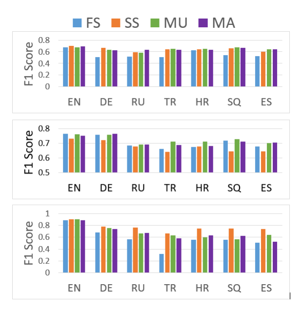
Figure 2: Performance with mBERT of few-shot (FS) cross-lingual transfer and the variants: SSMBA (SS), MIXUP (MU) and MIXAG (MA). Upper Figure: GAO domain, Middle Figure: TRAC domain and Lower Figure: WUL domian

A summary of cross-lingual transfer results for the variants - few-shot and few-shot with SSMBA, MIXUP and MIXAG - is provided in Figure 2 (we refer readers to Appendix C for all the results).