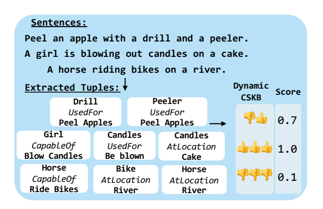
Figure 3: An example of our oracle commonsense scorer. We first extract tuples from a target sentence, and assign each extracted tuple with a commonsensical score using COMET (Bosselut et al., 2019), a dynamic commonsense knowledge base. The sentence-level score is then obtained by aggregating tuple-level scores.

obtain the final output distribution q(\mathbf{y}|\mathbf{x}) .