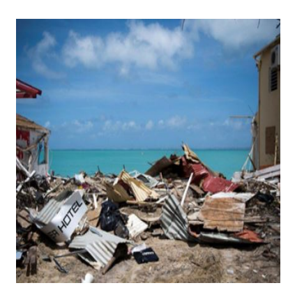
Figure 3: Tweet Text: The Hotel Heroes of Hurricane Irma https://t.co/Ge3QFiCVte https://t.co/8oA9wbPqeu

Actual tag: Task 1: informative ; Task 2: damage ; Task 3: Severity: severe - Structure: building Predicted: Task 1: Text and Image: informative ; Task 2: Text- non informative ; Image- <u>damage</u>; Task 3: Severity: <u>severe</u> - Structure: <u>building</u>