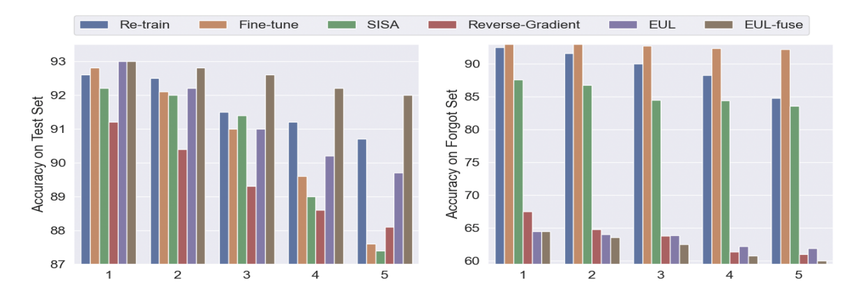
Figure 2: Sequentially unlearnling 1,2,3,4,5 different sets of data for T5-base on IMDB. The results are accuracy on the test set and the accuracy on the forgot set averaging across different orderings. Every single set contains 1% of the training data.