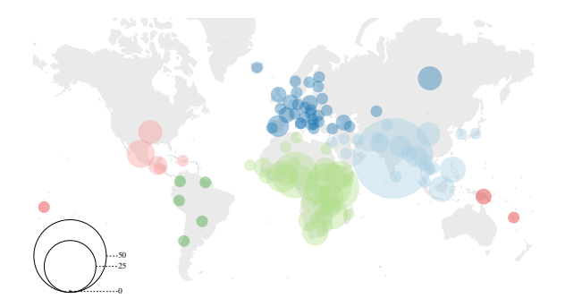
Figure 1: Most languages in our dataset are from the Indian Subcontinent and Sub-Saharan Africa, with significant minorities from Europe (primarily in the role of the high-resource language parallel translation available for each story). Color broadly indicates continent or region (North America, South America, Africa, Europe, Asia, Oceania) and size indicates number of languages per country in our dataset.

Building natural language processing (NLP) tools like machine translation, language identification, part of speech (POS) taggers, etc. increasingly requires more and more data and computational resources. To attain good performance on a large number of languages, model complexity and data quantity must be increased. However, for a majority of the world's 7000 languages, large amounts of data are often unavailable which creates a high barrier of entry (Blasi et al., 2022; Joshi et al., 2020; Khanuja et al., 2023). Increasing model complexity for large-scale models also requires disproportion-