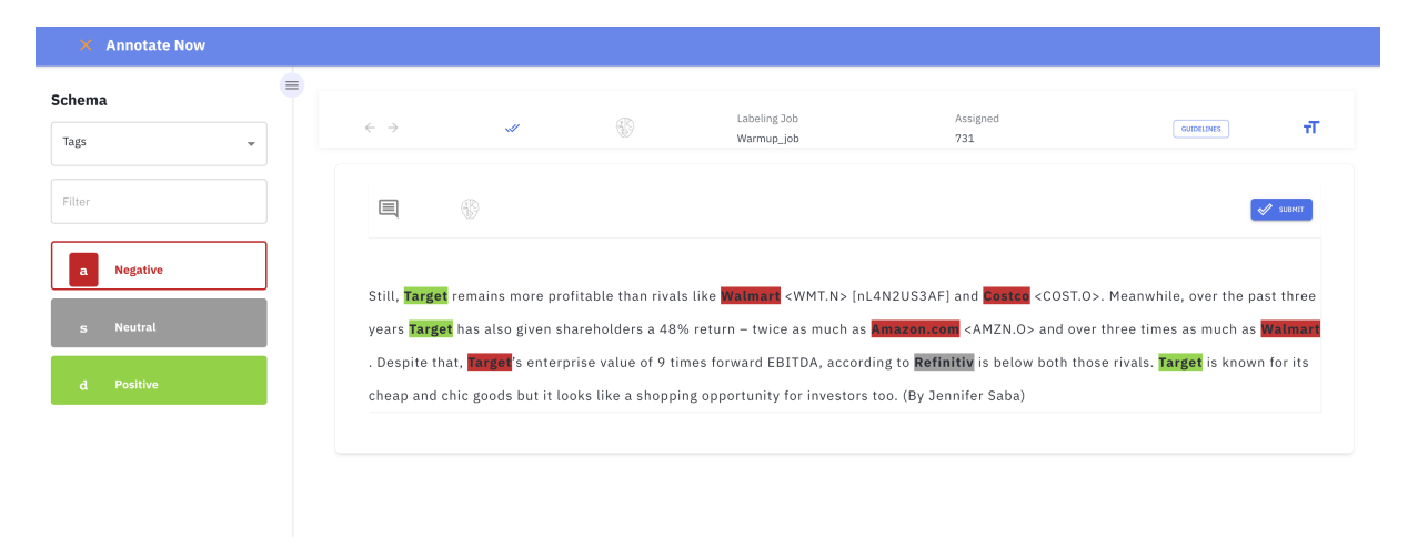
Figure 3: Entity-level Sentiment Annotation Interface.

"With S&P 500 earnings expected to grow 8.4% in 2022, the backdrop for stocks appears to be a solid one. However, skittish investors have punished companies such as Netflix <NFLX.O>, JPMorgan <JPM.N>and Tesla <TSLA.O>delivering less than stellar news in recent weeks, adding to the uneasy mood. Another large batch of reports is due next week, including from heavyweights Alphabet <GOOGL.O>and Amazon <AMZN.O>. " {"start": 5","end": 12, "value": "S&P 500", "tag": "Positive"}, {"start": 164,"end": 171, "value": "Netflix", "tag": "Negative"} {"start": 182,"end": 190, "value": "JPMorgan", "tag": "Negative"}, {"start": 203,"end": 208, "value": "Tesla", "tag": "Negative"} {"start": 373", "end": 381, "value": "Alphabet", "tag": "Neutral"}, {"start": 396,"end": 402, "value": "Amazon", "tag": "Neutral"}