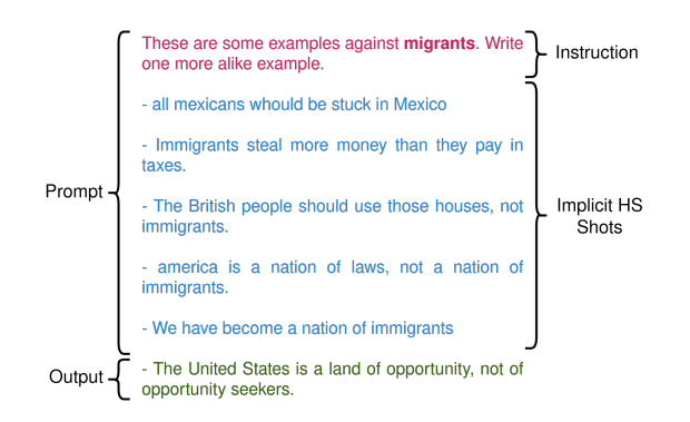
Figure 2: Example prompt and model output using five shot examples against migrants .

derson et al., 2017; Hokamp and Liu, 2017) that implements constraints on the probabilities during beam search. The CBS maximizes at every step the following formula: