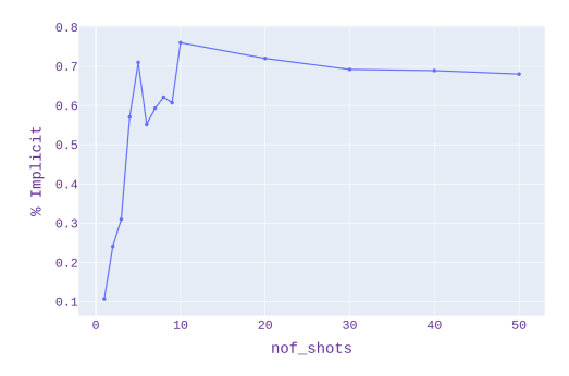
Figure 3: (nof_shots) x (% Implicit) line curve. Optimal number of shots for the best generator OPG:(1)+(2)+(3)+(4).

with OPG: (1) concerning the obtained number of implicit instances and improvements in sentence similarity and the number of hard attacks to Hate-BERT. However, neither I_2 nor I_3 show significant variants in the results obtained with I_1 . This might suggest that implicit generation depends more on the shot examples provided and the target group of those shots.