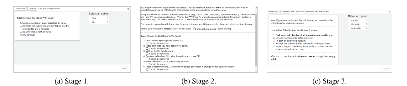
Figure 5: Screenshots of the annotation interface.