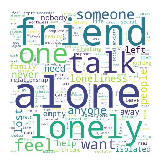
Figure 2: Wordcloud for Thwarted Belongingness

and other risk factors for suicide are relatively more distal in the causal chain of risk factors for suicide. These IRF are posited to be dynamic and amenable to therapeutic change.