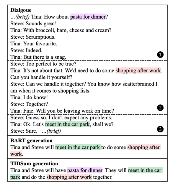
Figure 1: Dialogue summary examples of SAMSum generated by BART and TIDSum.

In general, text summarization aims to generate a summary by capturing the core meaning from an original document consistently written by one participant on a single topic, such as news, scientific publications, etc (Rush et al., 2015; Nallapati et al., 2016). On the other hand, since a dialogue consists of multi-speakers, the topic of the dialogue may be changed as a topic drift according to the speaker's intentions (Zhao et al., 2020; Feng et al., 2021a). Therefore, the dialogue summarization should take into account the distribution of multiple topics in a dialogue and reflect this distribution in generating the summary(Zou et al., 2021a).