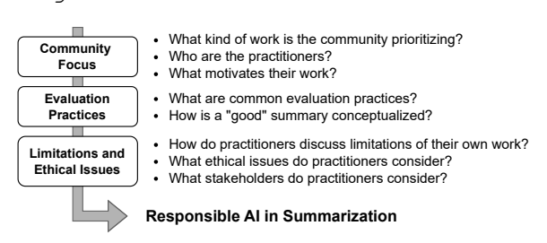
Figure 1: Overview of questions we examine when analyzing practices related to how the contemporary text summarization literature engages with RAI issues.

As their capabilities increase, especially with the emergence of large language models, automatic text summarization systems have seen increasing use—despite the known risks of generating incorrect, biased, or otherwise harmful summaries.