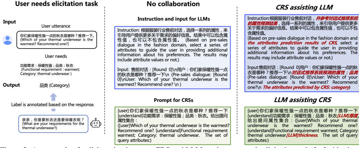
Figure 3: An example of collaboration between CRS and LLM on the user needs elicitation task. Left side shows the input and output of the task. The middle displays data used to fine-tune a LLM and train a CRS independently. The right side shows two cases of combining the two. Collaboration content is highlighted in red italics.

candidates according to their scores and include the ranking to the input of LLM. For other tasks, we only consider the final output of the trained CRS.