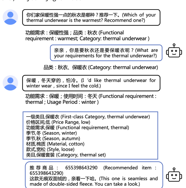
Figure 1: Example of E-commerce pre-sales dialogue.

E-commerce pre-sales dialogue refers to a dialogue between a user and a customer service staff before the purchase action (Chen et al., 2020; Zhao et al., 2021). A high-quality pre-sales dialogue can greatly increase the purchase rate of a user. However, there are many challenges to providing a high-quality pre-sales dialogue service (Liu et al., 2023b). Refine. Figure 1 shows an example of an e-commerce pre-sales dialogue. The bot needs to interact with the user, understanding the user's needs and responding with understandable words. Additionally, it should offer appropriate recommendations and elicit further preferences from the user.