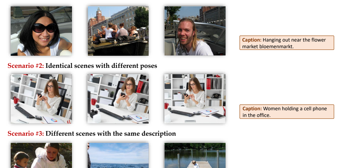
Figure 3: Set of images from conceptual captions dataset with the same captions under ( Top ) Scenario #1): Different views from the same event. ( Middle ) #2): Identical scenes with different poses. ( Bottom ) Scenario #3): Different scenes with the same description. The example of images are from Conceptual Captions (Sharma et al., 2018)