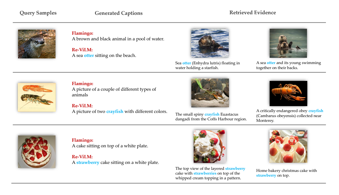
Figure 1: Examples of input images and output captions from 2.1B Flamingo (re-implemented) and 2.4B Re-ViLM. Re-ViLM can utilize the retrieved captions to generate more informative and accurate captions.

powerful pretrained autoregressive LM tends to ignore the poorly encoded external knowledge. ii ) In multi-modal datasets, there are cases where multiple captions describing the same image (e.g., from different annotators (Lin et al., 2014)), and multiple images having the same caption (e.g., see images in Figure 3 in Appendix). Thus, simply performing standard nearest neighbor retrieval tends to make the model take a shortcut and copy-paste retrieval examples during training. iii ) Training the model on large-scale interleaved \langle image, text \rangle dataset facilitates few-shot learning capability (e.g., M3W in Alayrac et al. (2022)), but it is really expensive to collect such dataset.