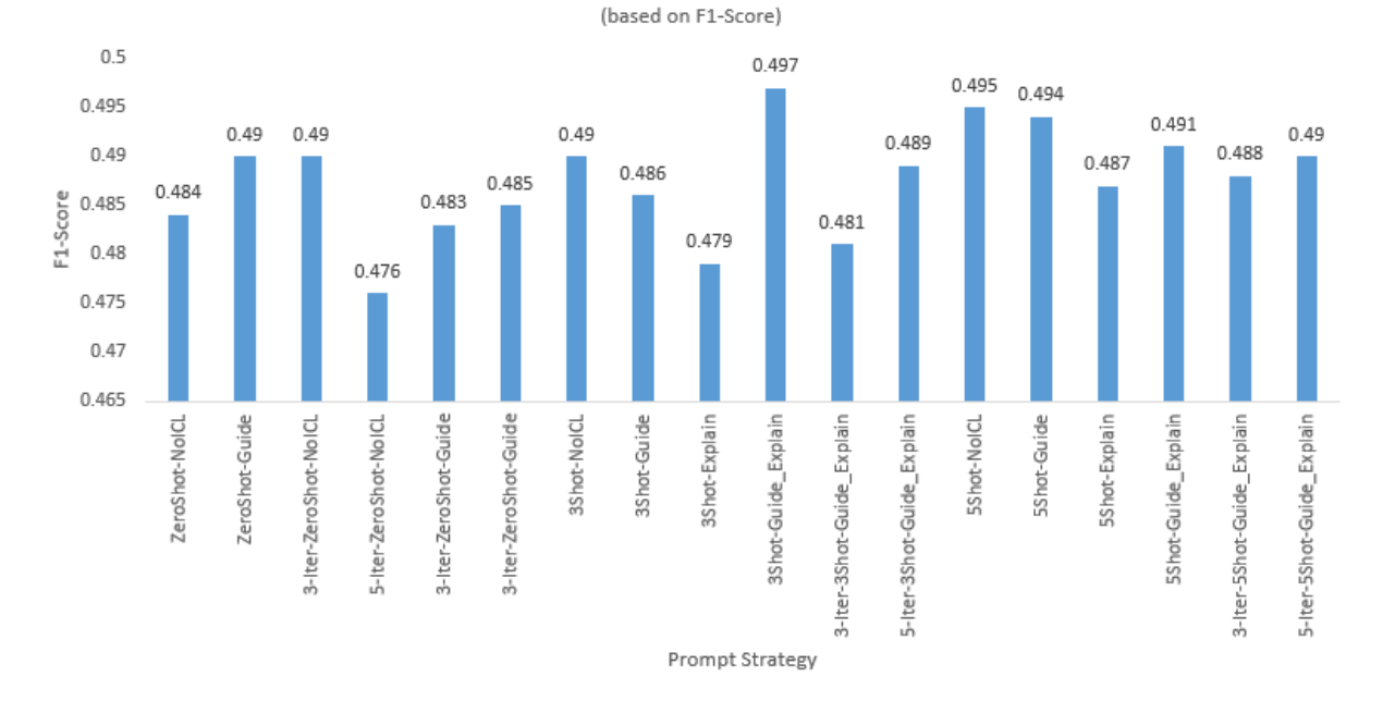
Evaluating the Performance of ChatGPT for NER