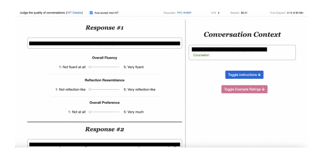
Figure 3: Mechanical Turk Developer Sandbox survey user interface with the text redacted given privacy limitations. Note that all six responses for a given conversational context were presented on the screen in a scrollable view.

Figure 3 illustrates the user interface for the survey annotators completed for the human evaluation, and Figure 4 illustrates the instructions users could toggle throughout the survey. Users could also toggle example ratings, but these examples have been omitted given that the text of the examples themselves would need to be redacted.